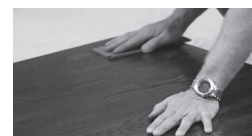
SAND TO REMOVE GLAZE AND IMPROVE ADHESION