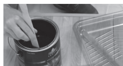
STIR WELL BEFORE AND AFTER APPLICATION