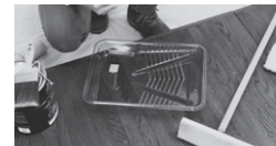
APPLY WITH A GOOD QUALITY BRUSH OR PAD APPLICATOR OR BY SPRAYING