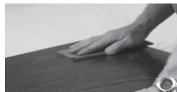
SANDING #120-#150 GRIT WITH THE GRAIN