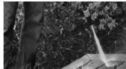
PRESSURE WASHING 2500 PSI