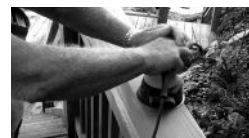
IF NECESSARY, FINISH SANDING