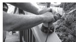
FINISH SANDING #60-#80 GRIT