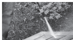
PRESSURE WASHING 3000 PSI