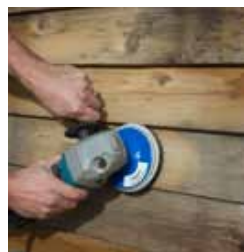
Buffy Pad System